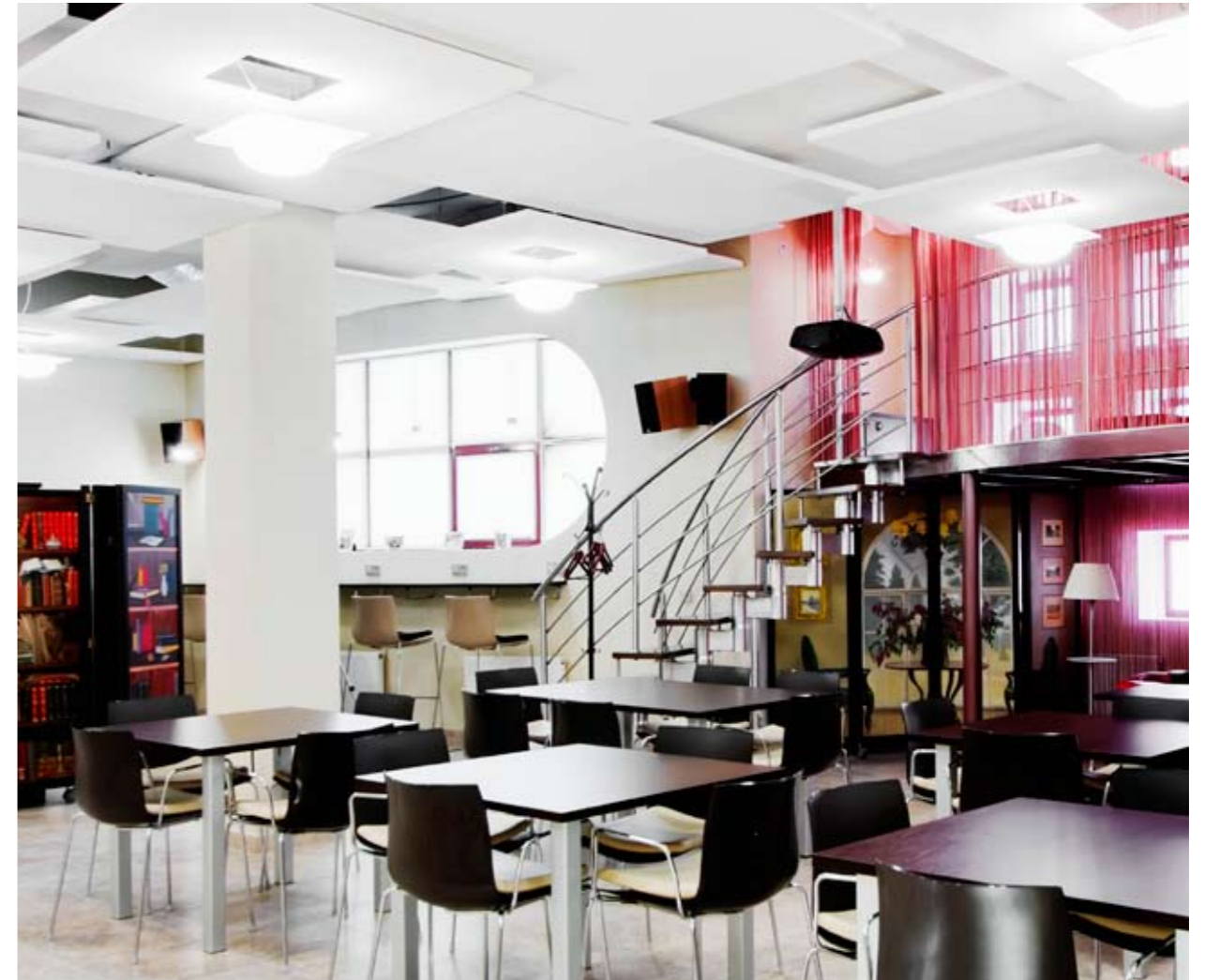
Architect: Tatyana Silyuk "ArhBuro Stakad"