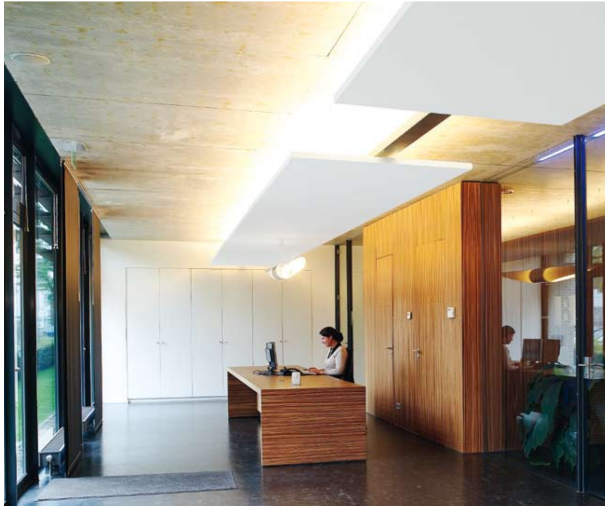
Architect: Arcitecten M30