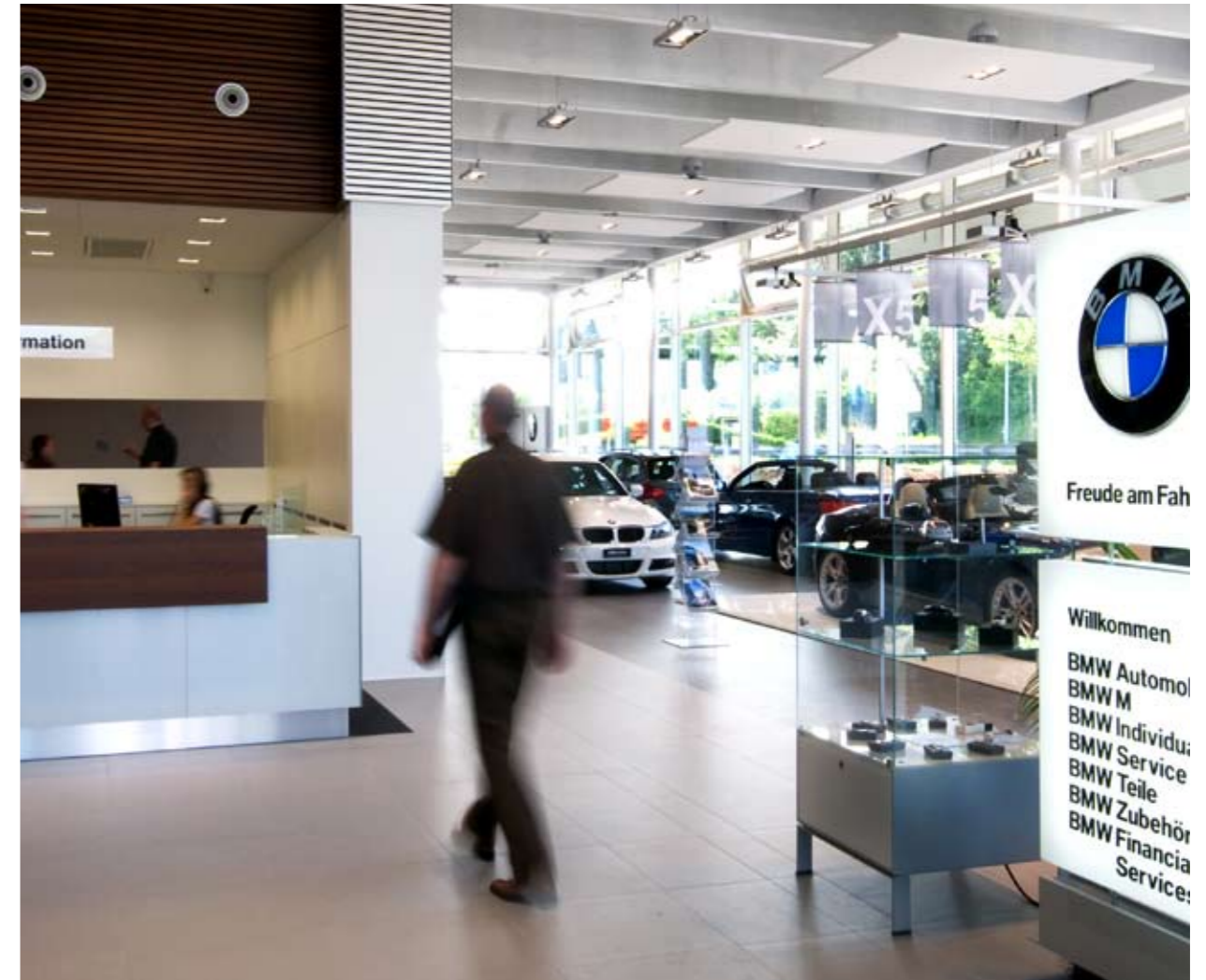
Architect: Kräher Jenni + Partner AG Architekten SIA Architekten SIA