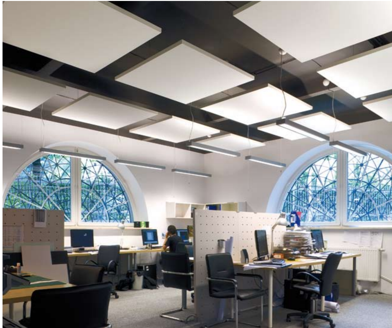
Architect: Grupa 5 Architekci