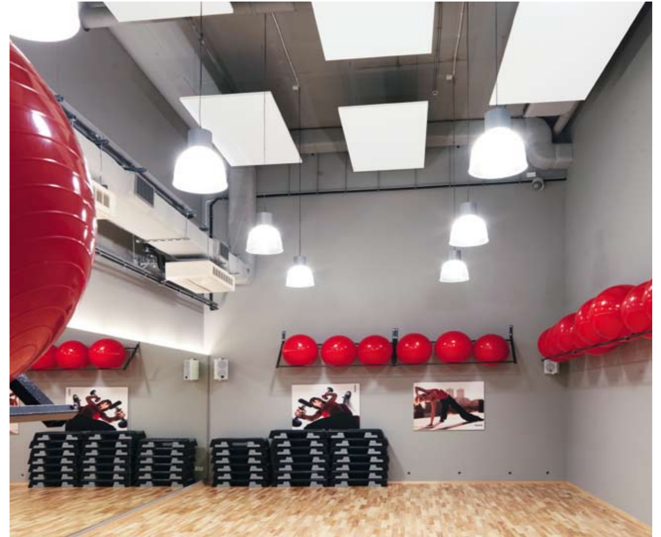
Architect: Studio Quadra