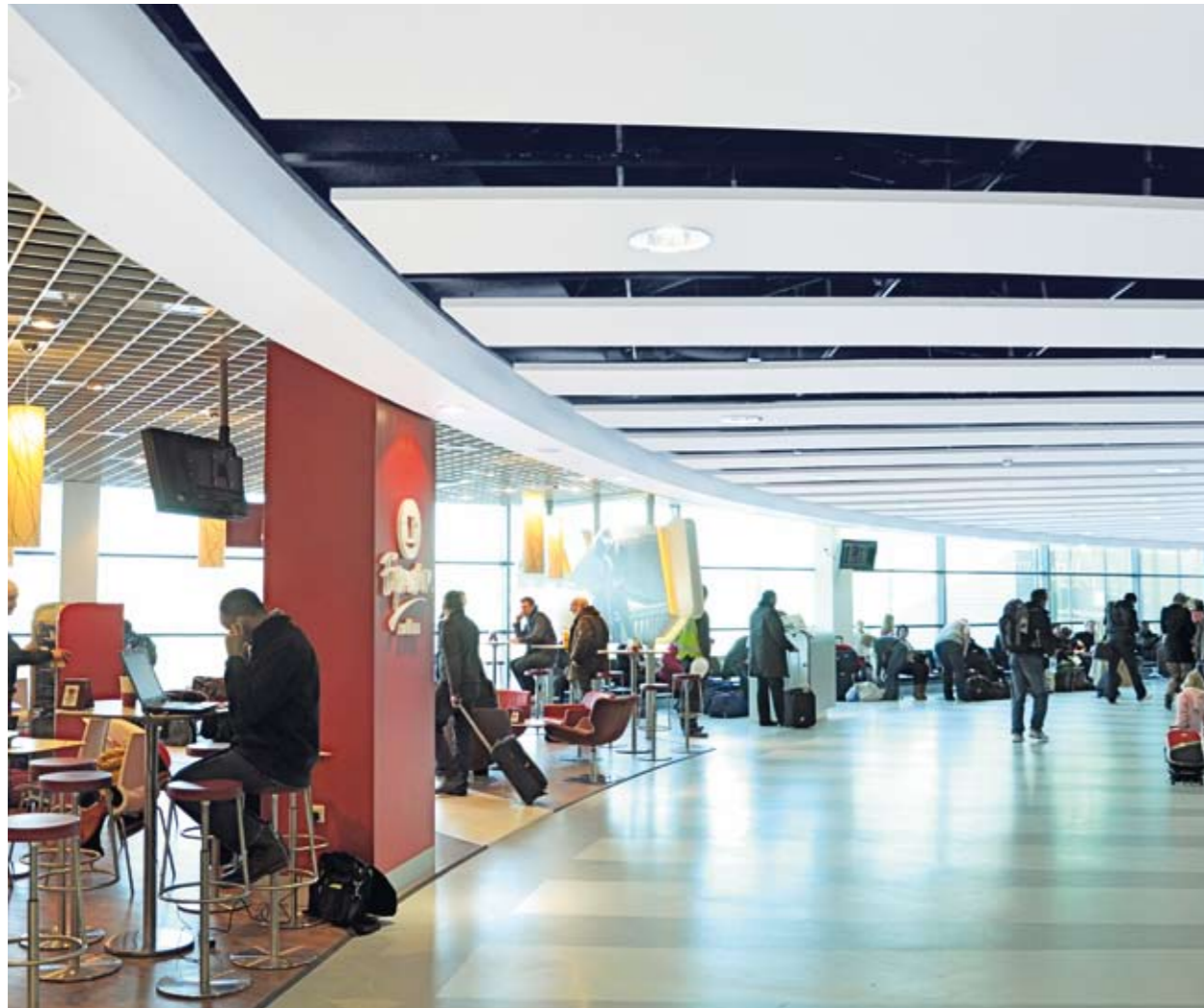
Architect: BDP Belfast