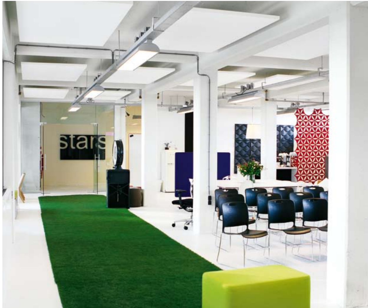
Architect: Innvire Workplace Innovation